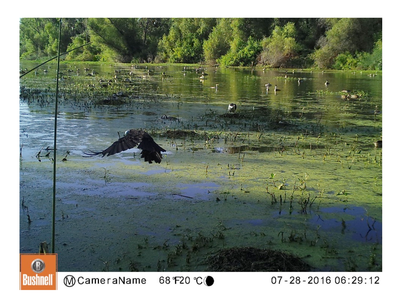
Fig. 3. American Crow predation on an egg from a grebe nest at Rodman Slough: South on 28 July.