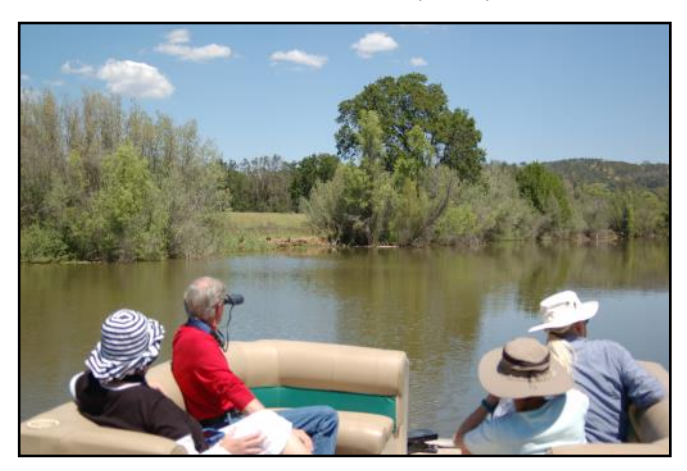
Heading down Cache Creek on May 3 during the 20<sup>th</sup> annual Heron Days presented by the Redbud Audubon Society.