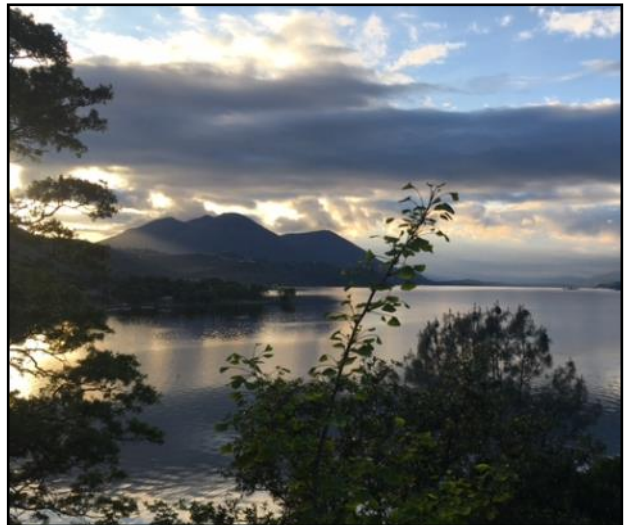
Clear Lake with Mount Konocti in the background.