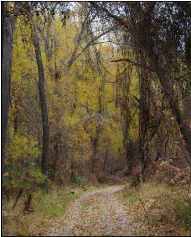
The McVicar Trail at Anderson Marsh State Historic Park is the site of the first Redbud Audubon field trip this year.