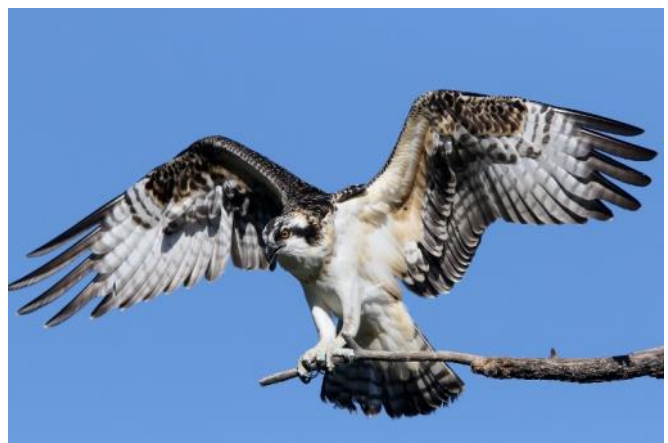
Counters might see some juvenile Osprey on the December 16 annual Christmas Bird Count (CBC).

With all of the issues, including climate change and habitat loss, facing both local bird species and birds worldwide, there is no time like the present to start getting involved in local bird conservation and educating yourself about the numerous bird species we have right here in Lake County; the annual Christmas Bird Count is a fun way of doing this.