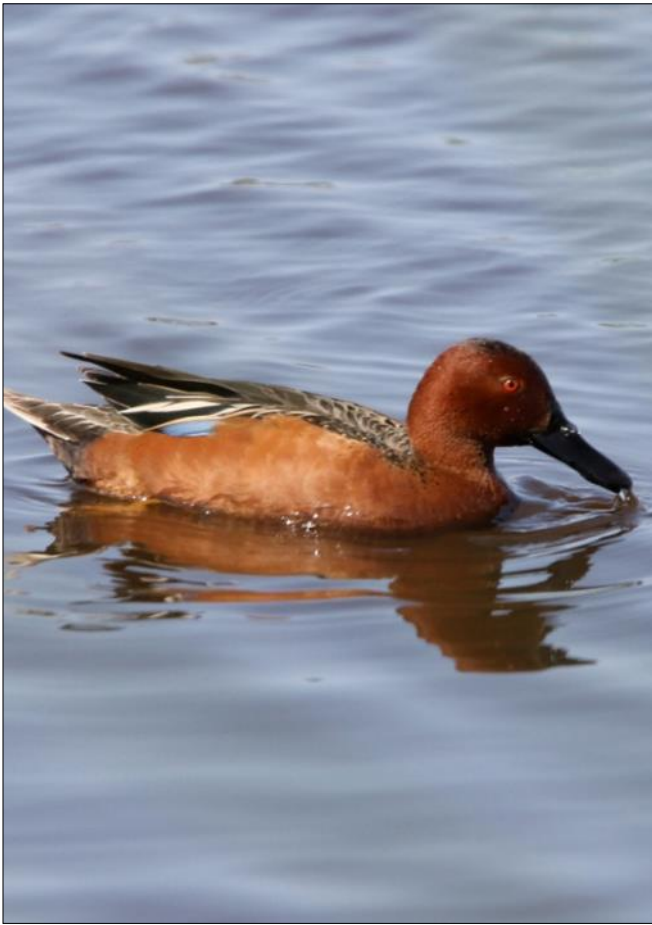
The Cinnamon Teal is a stunning duck and frequents wetlands and ponds in Lake County.