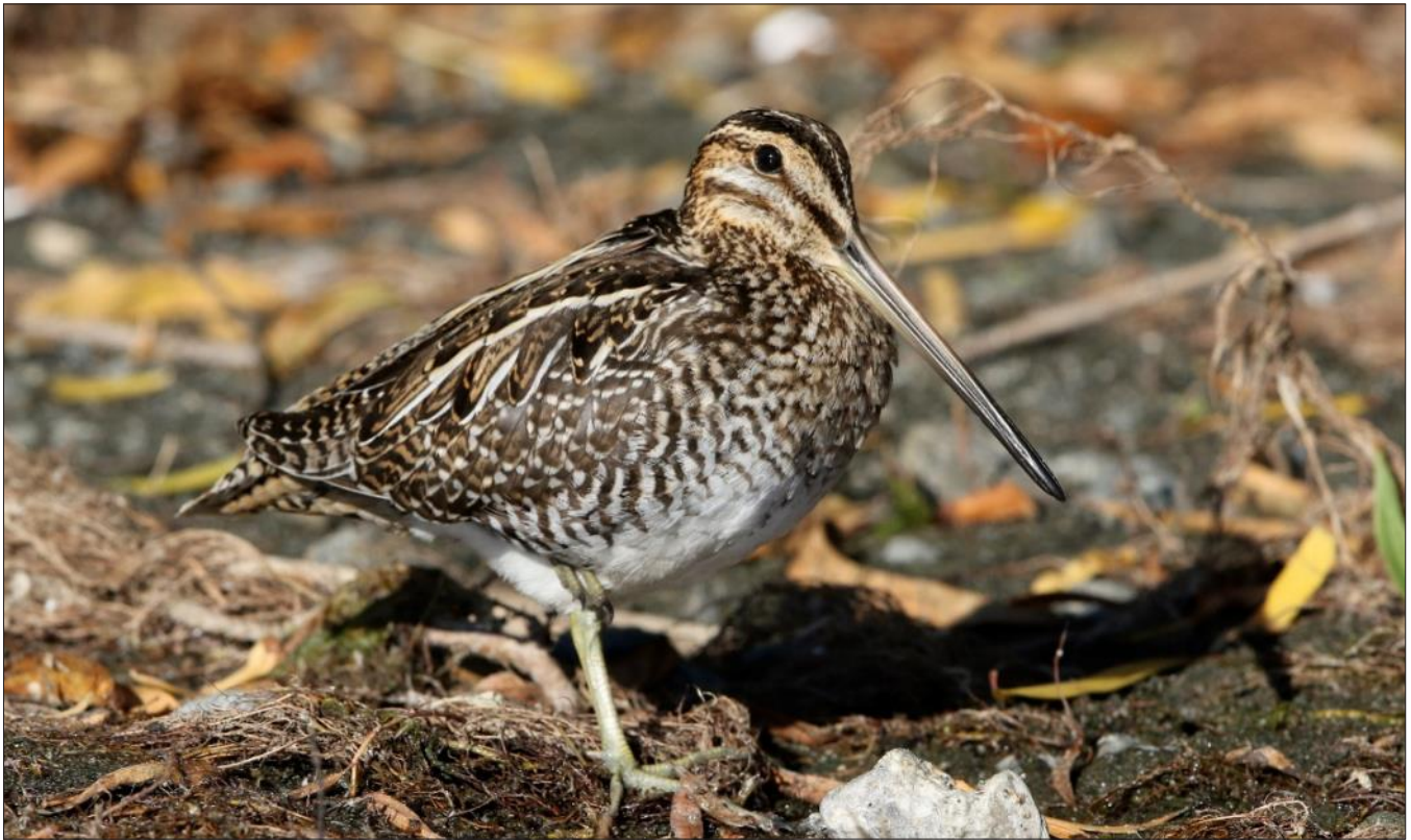
Wilson's Snipes are a secretive bird that frequents mudflats in wetland and lake areas.