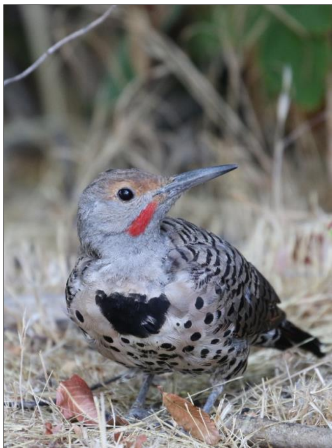
Northern Flickers should be spotted on the 43 rd CBC being held by Redbud Audubon.