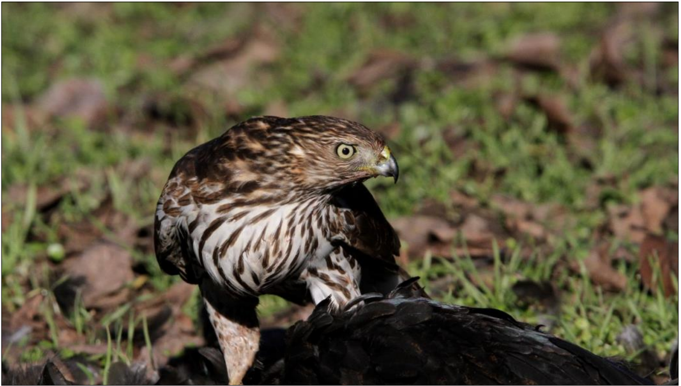
A juvenile Cooper's Hawk with its prey on the ground. Watch for Cooper's Hawks on the Bird Count.