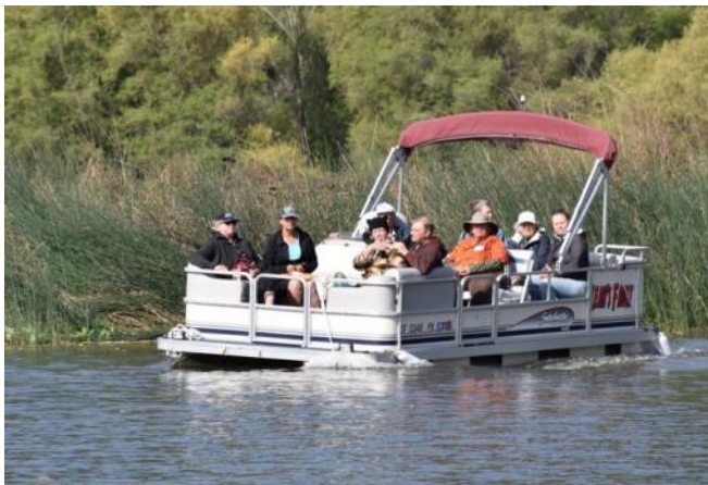
Out in the Marsh.