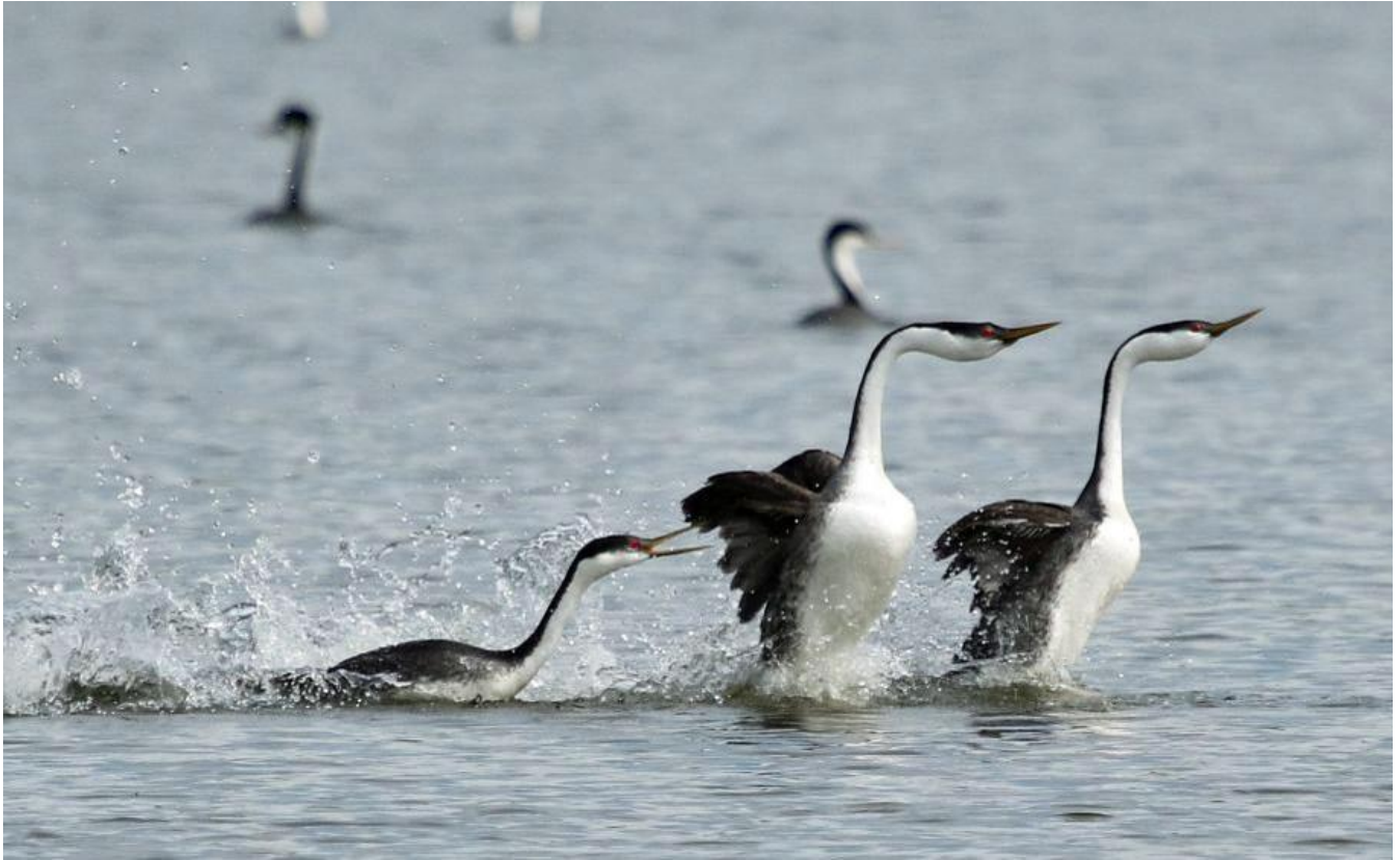
Two Western Grebes engaging in a mating ritual.