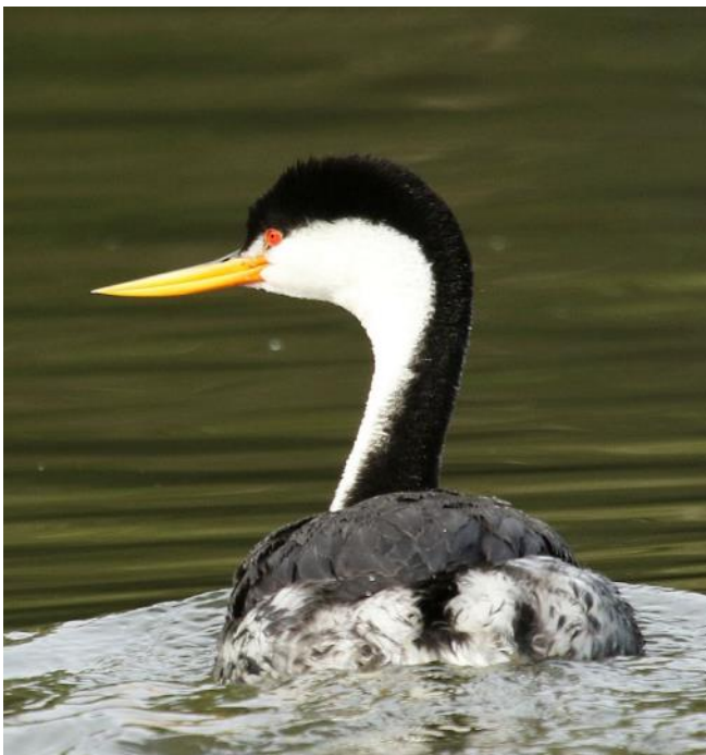
A Western Grebe in Anderson Marsh during the May 5 Heron Days event.