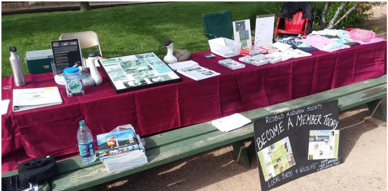
Redbud's display included birding field guides, grebe project photos and brochures, and grebe t-shirts.