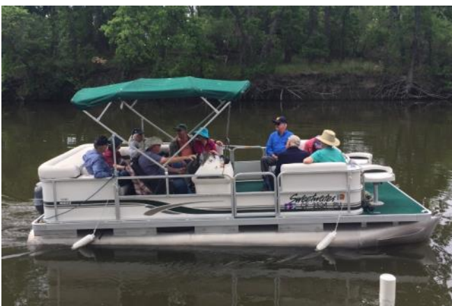
Heading out from Clear Lake Campground into Anderson Marsh for the May 5 Heron Days event.