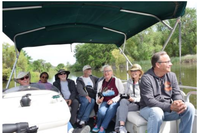
A happy group on a boat in Anderson Marsh State Park marsh.