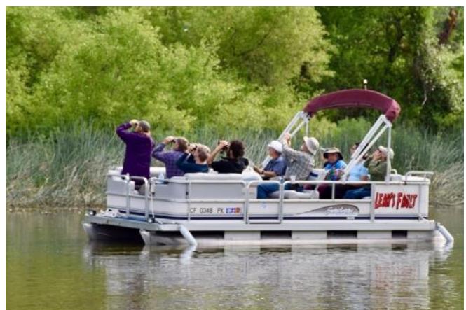
Viewing the heron and egret rookery on Slater Island in Anderson Marsh State Park.