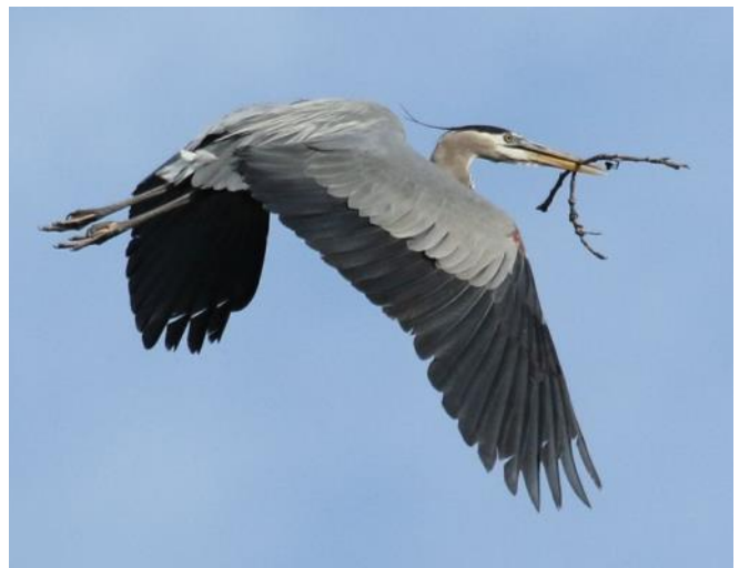
A Great Blue Heron is seen carrying a twig to its nest in Anderson Marsh State Park during May's annual Heron Days event presented by the Redbud Audubon Society.