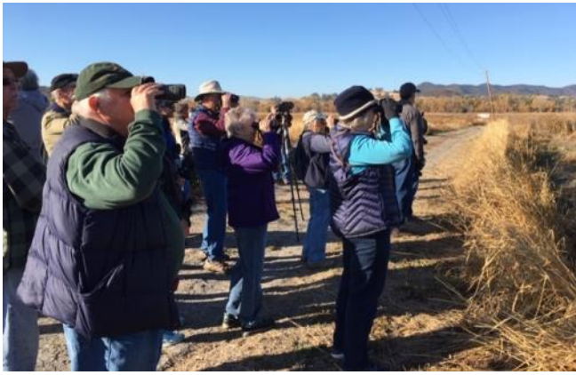
There was lots to see on the Nov. 23 Redbud Audubon Field Trip.