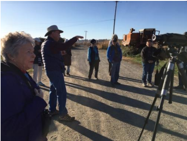
Folks gather at the beginning of the field trip to learn about the lay of the land and the story of the Reclamation District.