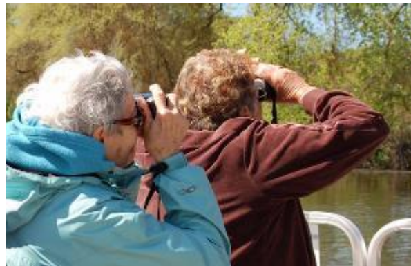
Looking forward to seeing everyone in Spring 2021 for our next Heron Days!