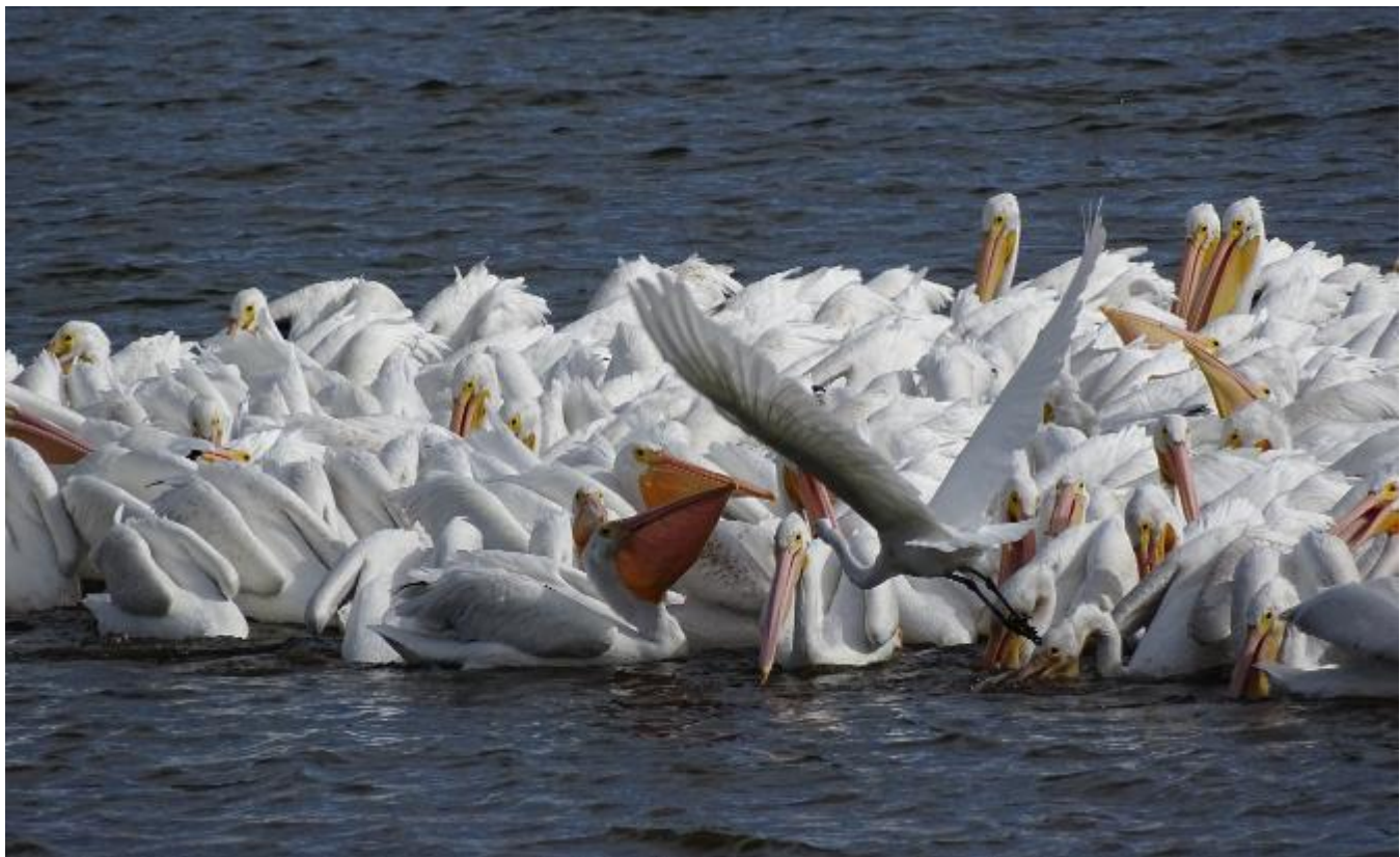
American White Pelicans