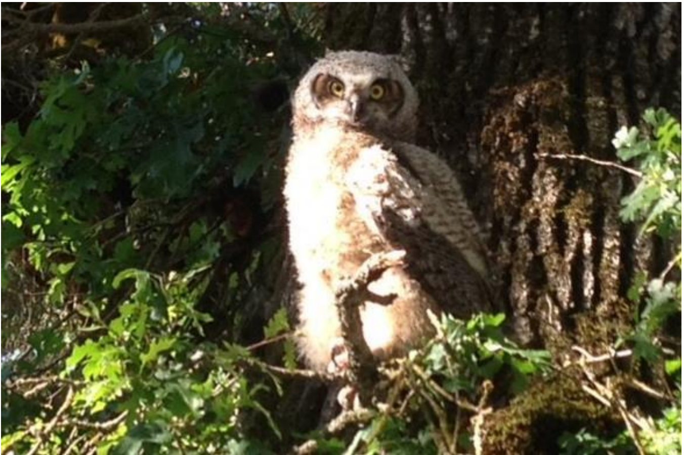
Juvenile Great Horned Owl