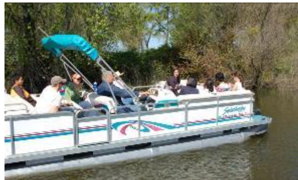
A previous Heron Days trip.

Heron Days, and our remaining program meetings and field trips for this season are cancelled. We look forward to seeing everyone in the Fall.