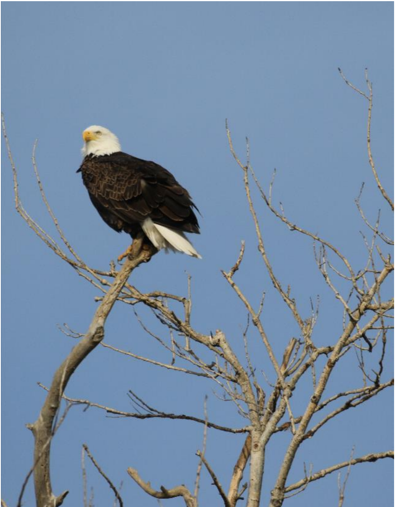
American Bald Eagle