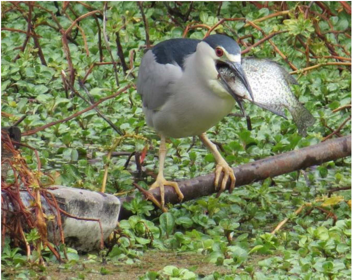
Black-crowned Night Heron