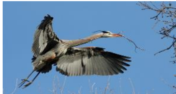
Great Blue Herons can still be seen, even if not at our Heron Days event.