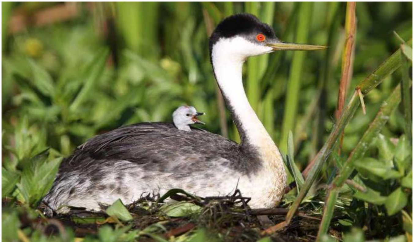
Western Grebe and chick