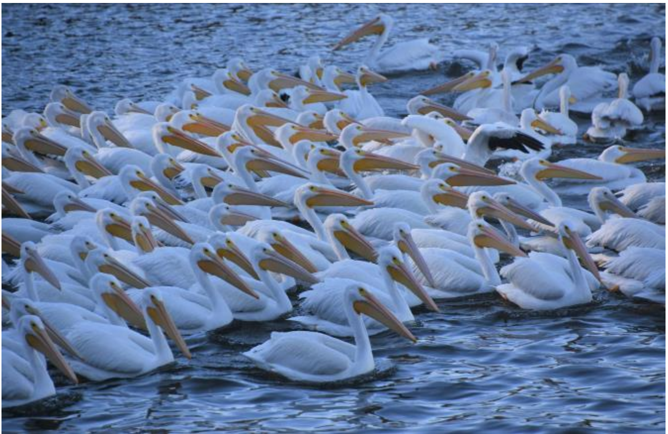
American White Pelicans