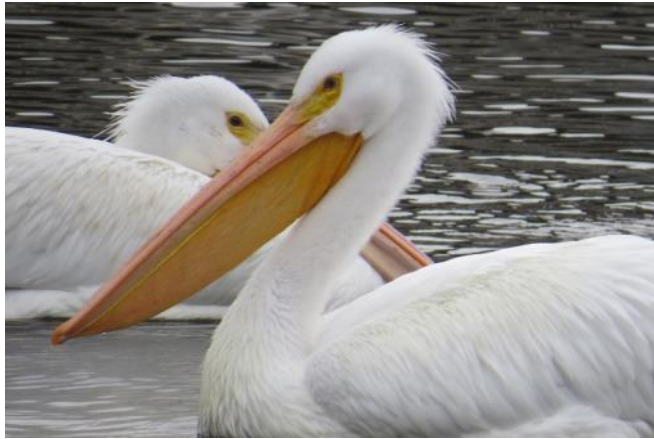
American White Pelican

Photos by Brad Barnwell (more on following pages)