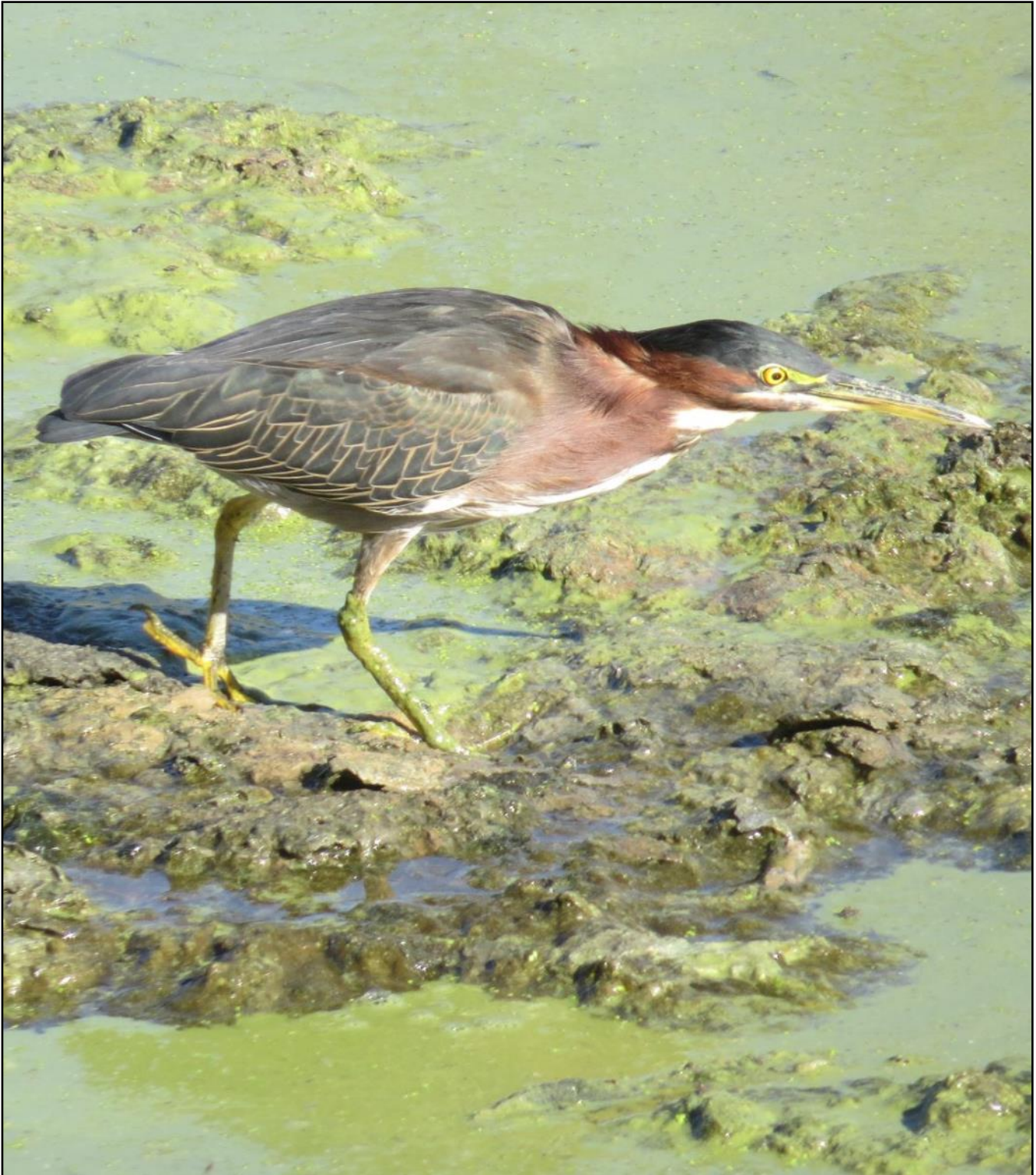
Green Herons live on Clear Lake all year long. If you are participating in the CBC near the lake or other water way, you might see one.