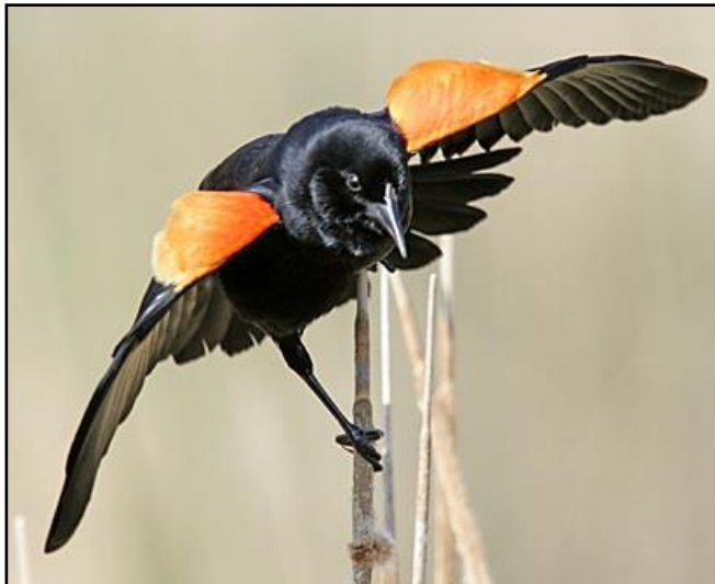
Redwing Blackbird should be in Lake County in abundance.