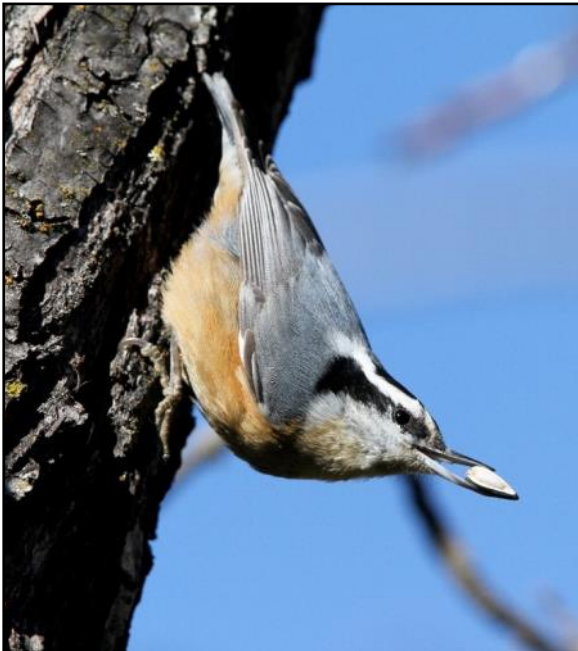
Red-breasted nuthatch are a common passerine in Lake County that should be seen on the count.