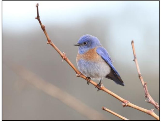
Western bluebird.