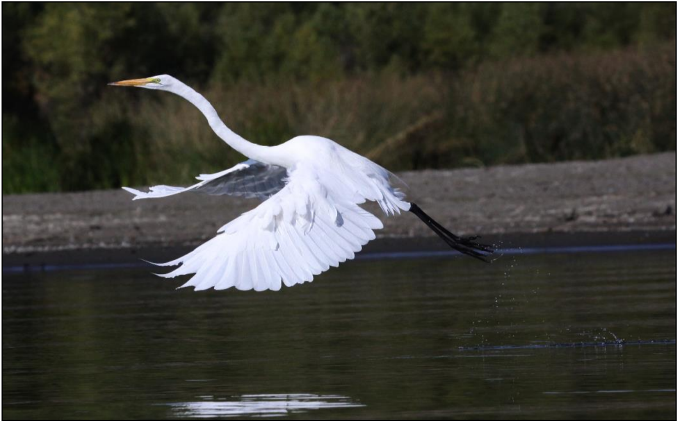
Great Egrets are enjoying fishing on the lake this time of year.