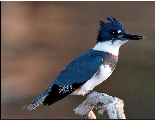
The Belted Kingfisher is another lake bird that you may be gifted in spotting during the upcoming CBC.