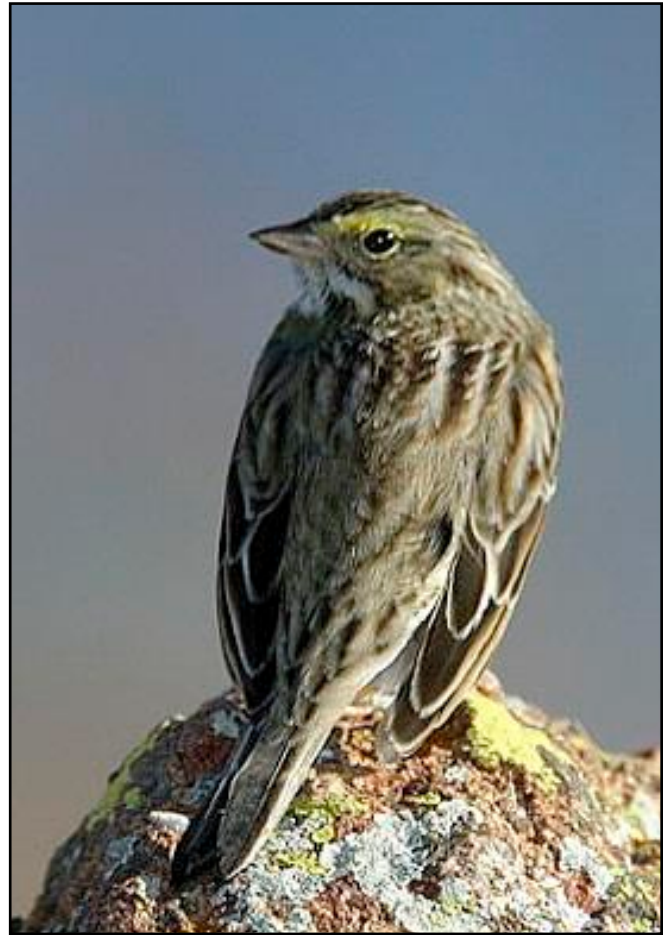
Savannah Sparrows are not as common as Golden-crowned or White-crowned here but they are known to migrate through.