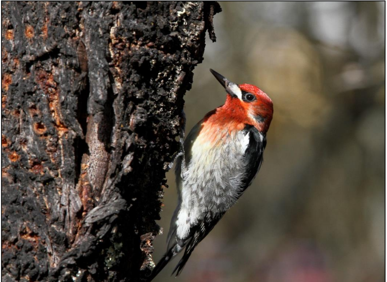
Red-breasted sapsucker.