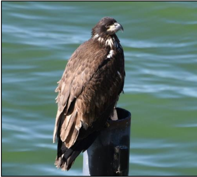
If you're lucky, you might see a juvenile or mature Bald Eagle during the CBC.