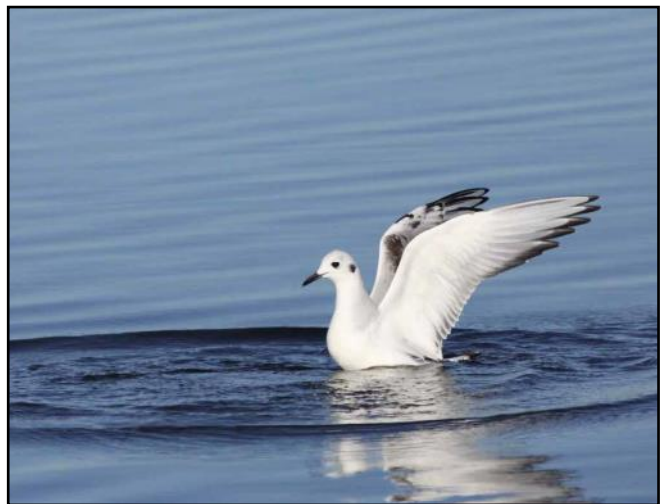
Bonaparte's gull.