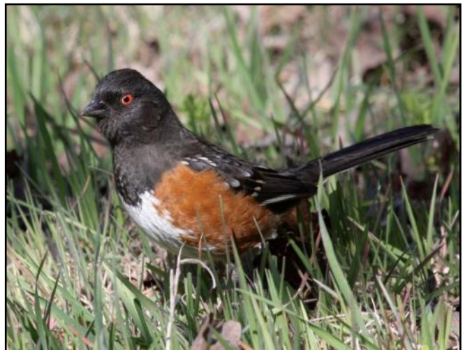
Spotted Towhee.