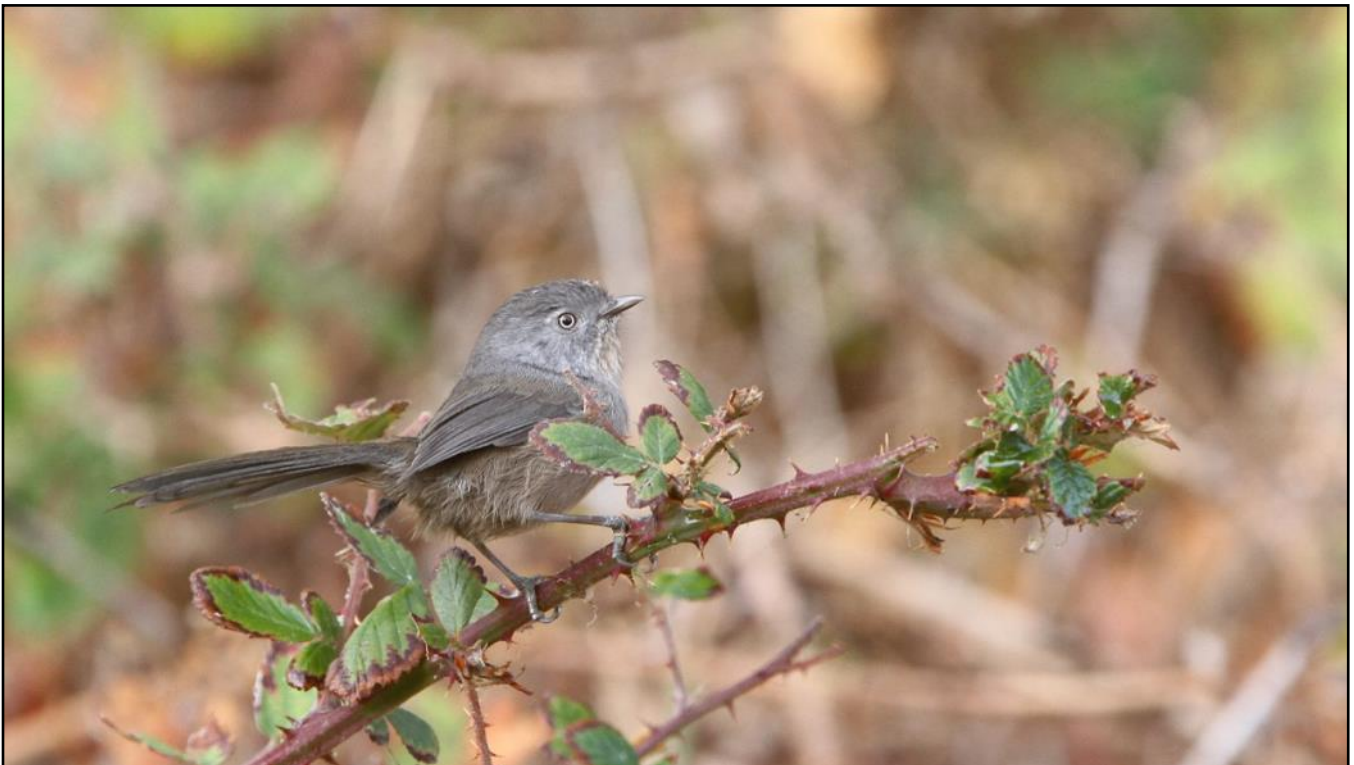
Wrentits are secretive and make chaparral their home. They live in Lake County year around.