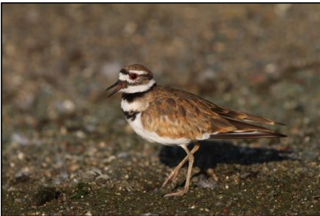
Adult killdeer.