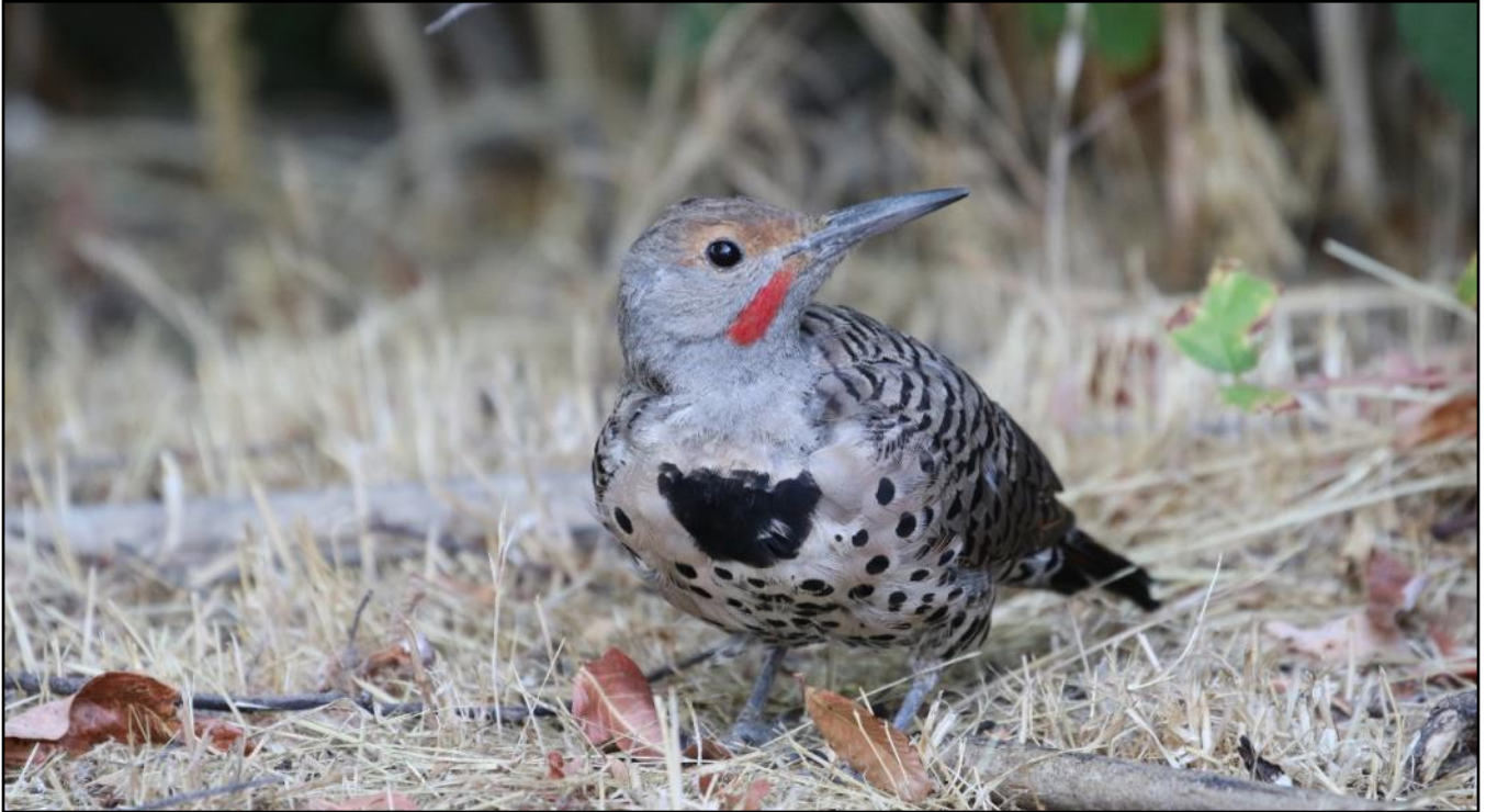
The Northern Flicker is also a common sighting.