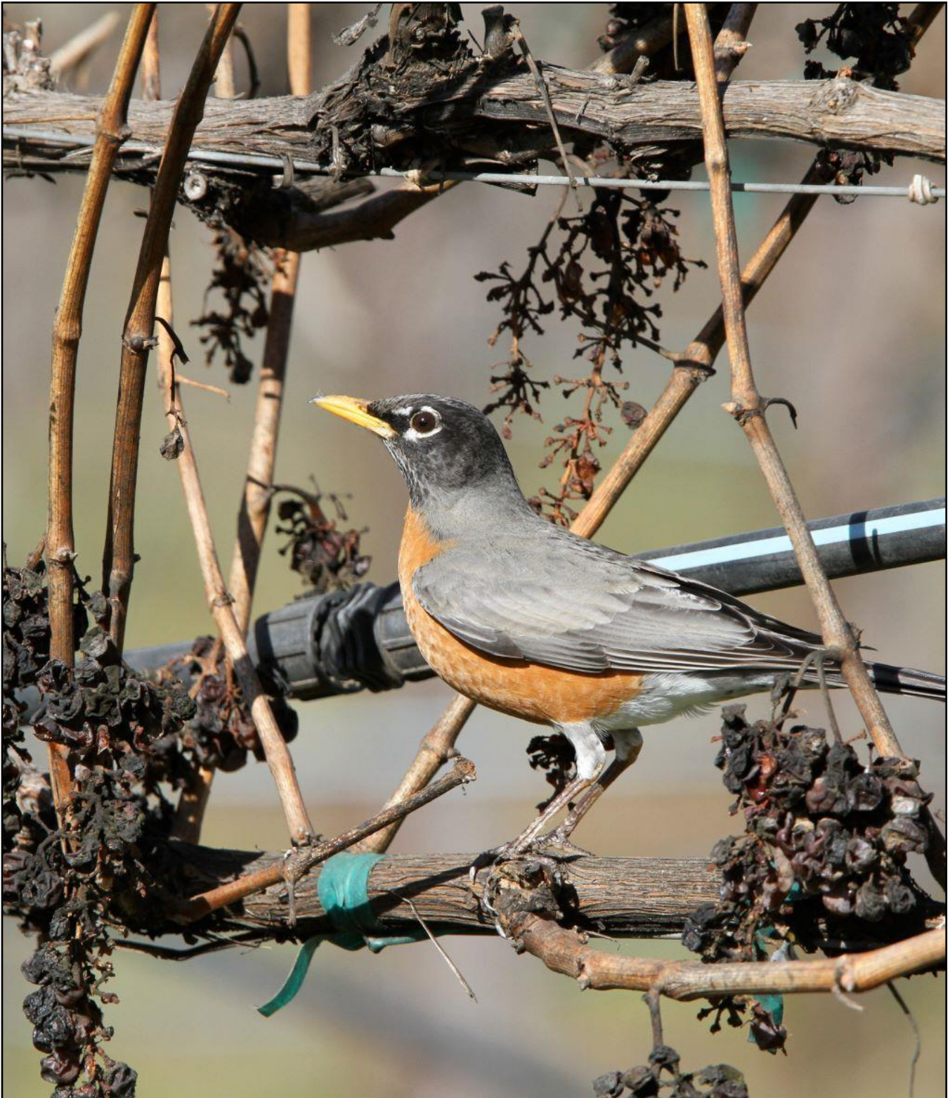
Robins are still frequenting the county and are always fun to see.