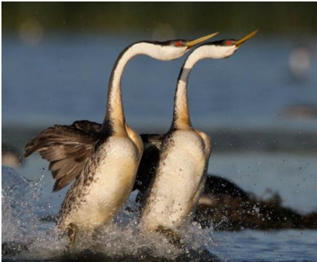
The grebes are doing their courtship dances now.