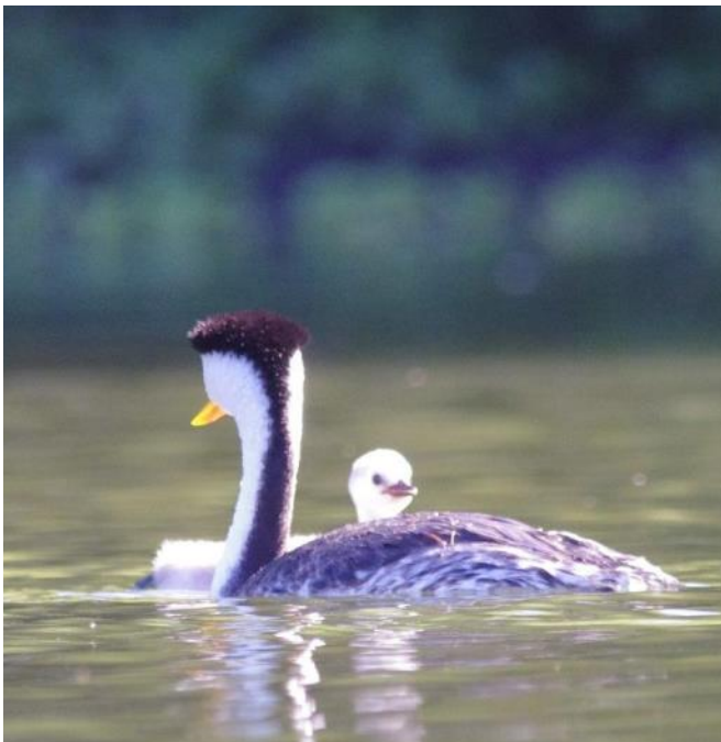
A grebe with baby.