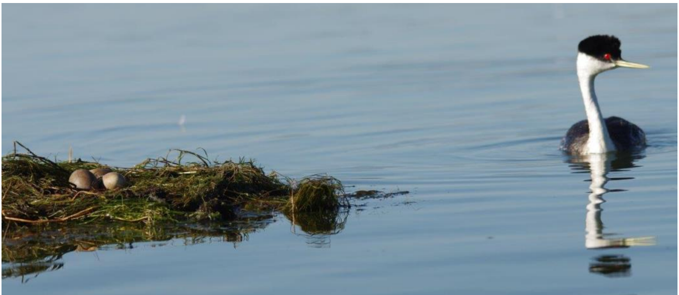
A Western Grebe keeps a watchful eye near its clutch of eggs in a floating nest.

Even though Redbud Audubon takes a break for the summer, that doesn't mean you have to! Get out early and enjoy the sounds of the glorious songbirds that make Lake County either their permanent or nesting home. There is nothing like the song of a Black-headed Grosbeak, or the chattering of an Oriole to start out your day!