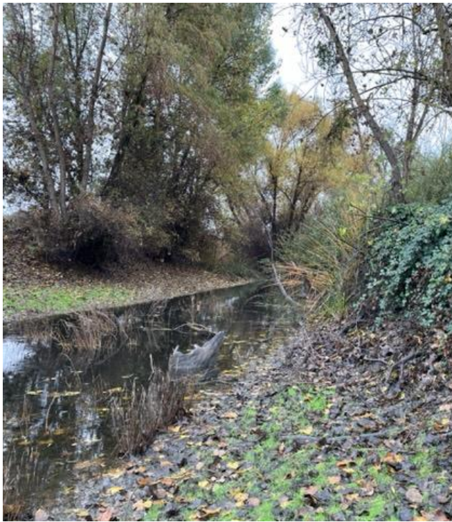
Habitat at the Melo Wetland Preserve.