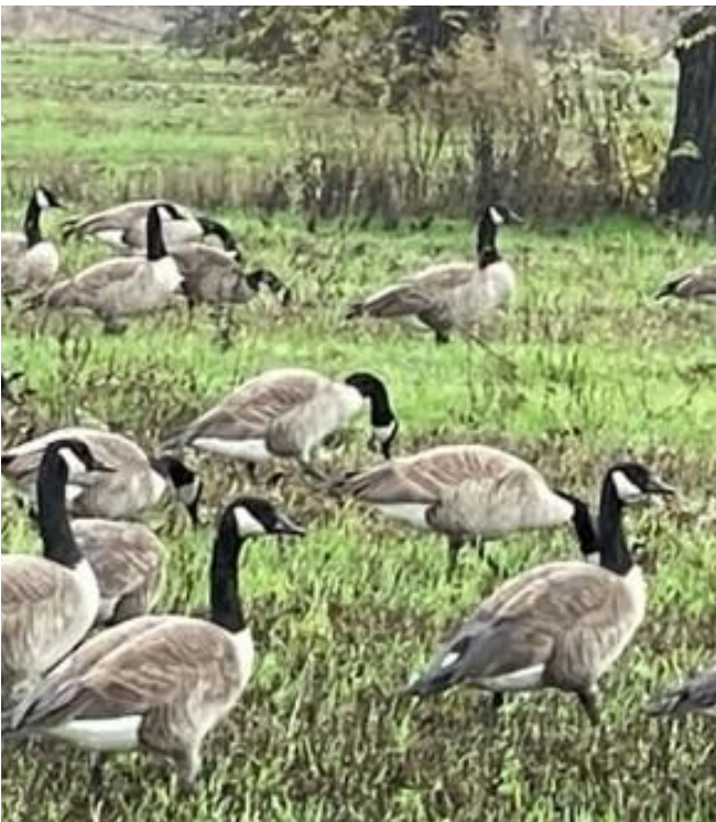
A flock of Canada Geese was sighted in an orchard adjacent to the preserve.