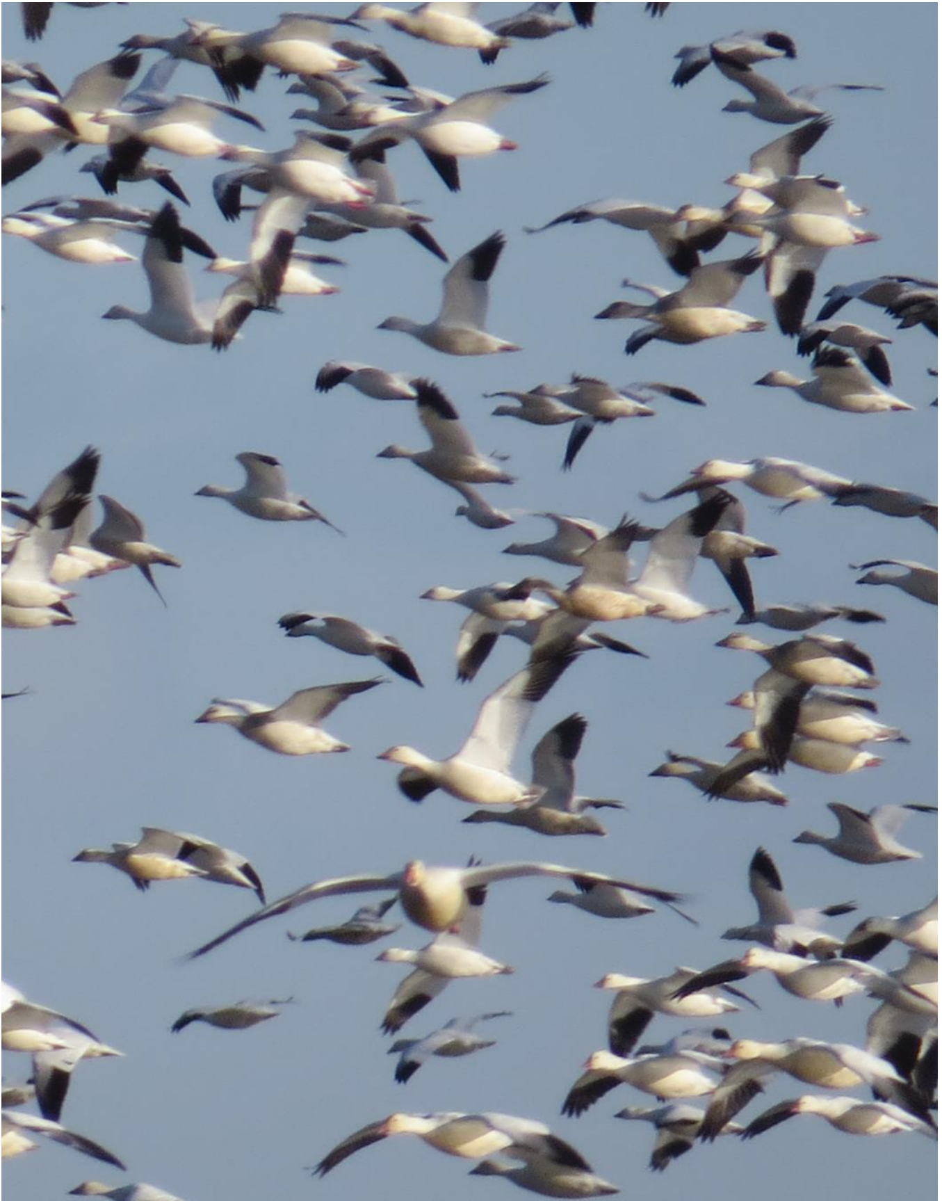
Flocking Snow Geese have interesting formations.