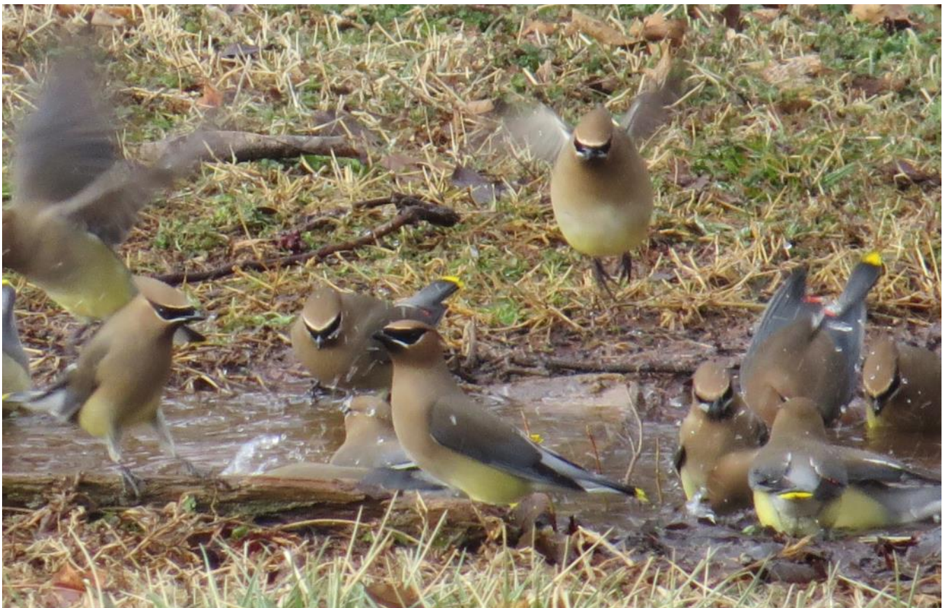
Who doesn't enjoy seeing a flock of noisy Cedar Waxwings as they attack a toyon tree?