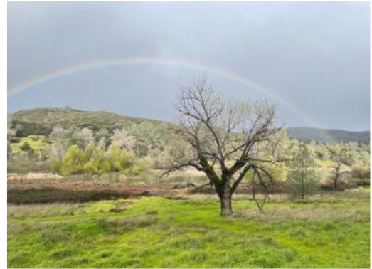
A beautiful rainbow at last month's field trip to Highland Springs.

March's field trip was scheduled for rain or shine. Unfortunately, it poured so the outing was shortened. Highland Springs Reservoir highlights were a rainbow, beautiful views and of the 70 species expected to be seen, six were spotted: Western Bluebirds, Yellow-rumped Warblers and Lesser Goldfinch, Canada Goose, Red-winged Blackbirds and Double-crested Cormorants.