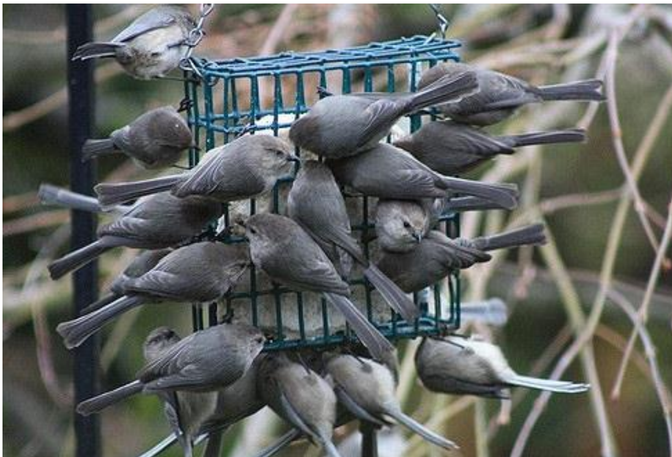
Bushtits are among the many small passerines that flock.