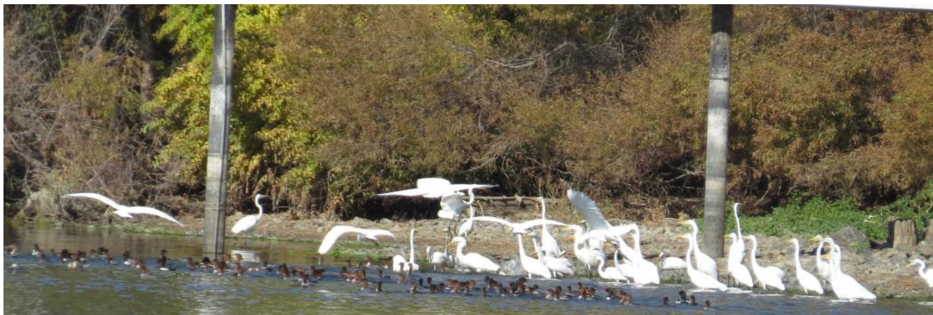
Mergansers and White Egrets are often seen in flocks. (See photos on next page)