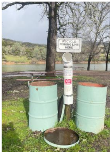
Monofilament collecting bin at Highland Springs.

Did you know it's estimated that monofilament line takes 600 years to break down once discarded! The line can be a hazard to birds, especially waterfowl. That is why Redbud Audubon has placed fishing line disposal containers at different locations around the lake and also monitors and cleans them.