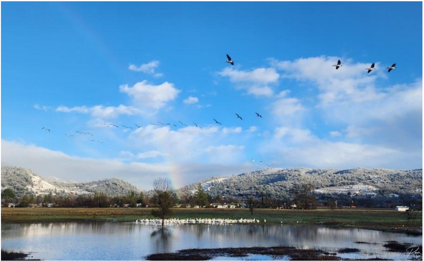
Clear Lake's iconic White Pelicans; a "flock" of pelicans is called a squadron or a pod.