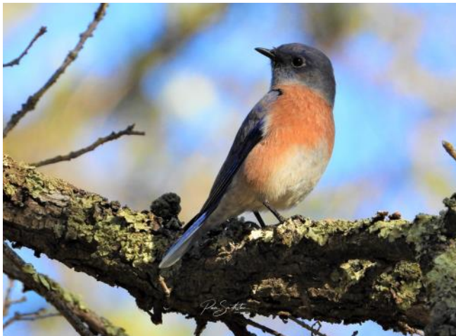
Bluebirds are active at the Rodman Preserve and will probably be seen at the May 18 walk there.