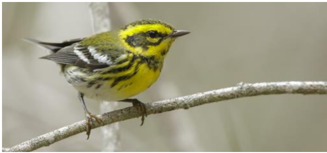
First-winter male Townsend's Warbler.