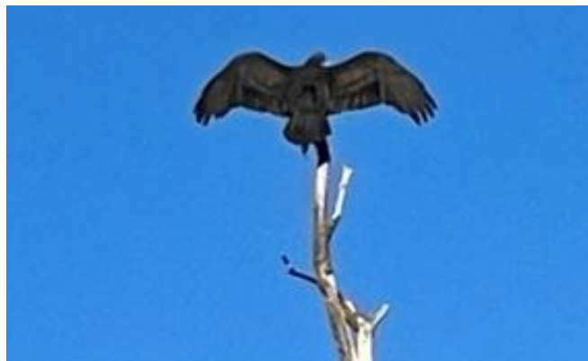
A Turkey Vulture in a "heraldic pose." See more photos next page.

Scientists rely on the remarkable trend data of Audubon's CBC to better understand how birds and the environment are faring throughout North America – and what needs to be done to protect them. Data from Audubon's signature Citizen Science program are at the heart of numerous peer-reviewed scientific studies.