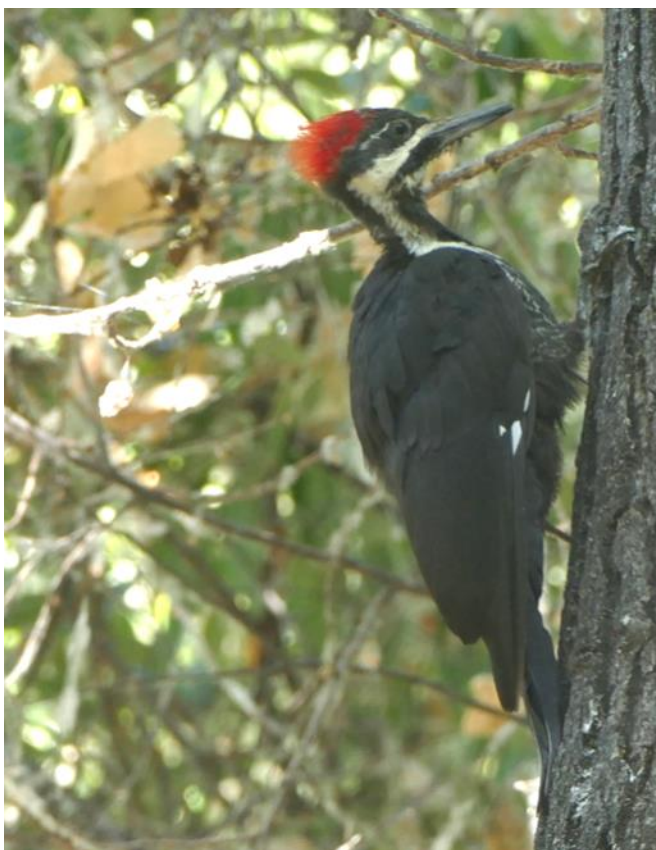
Pileated Woodpecker could be seen on the count.