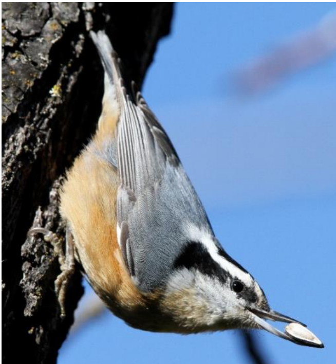
Red-breasted Nuthatch are usually found in some parts of the county.