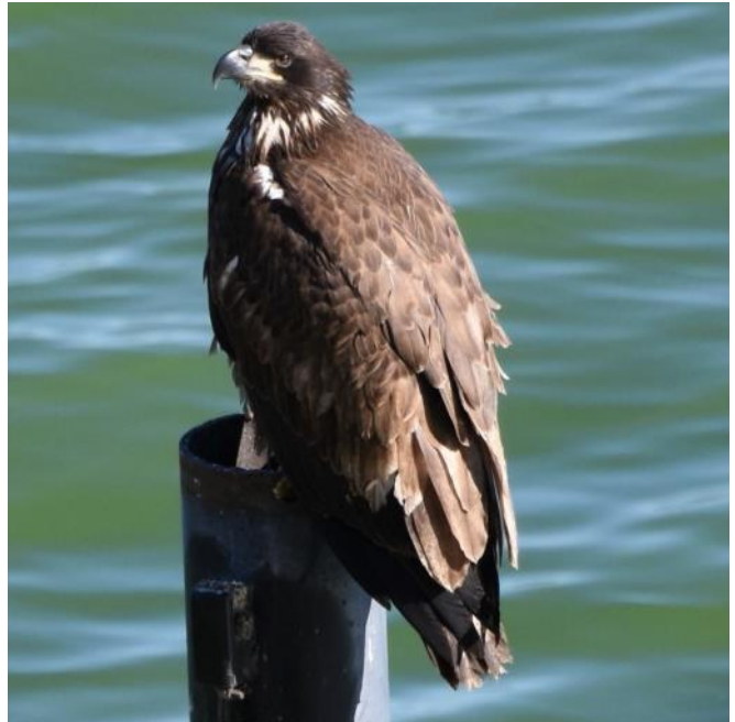
Juvenile Bald Eagle perched on Clear Lake.