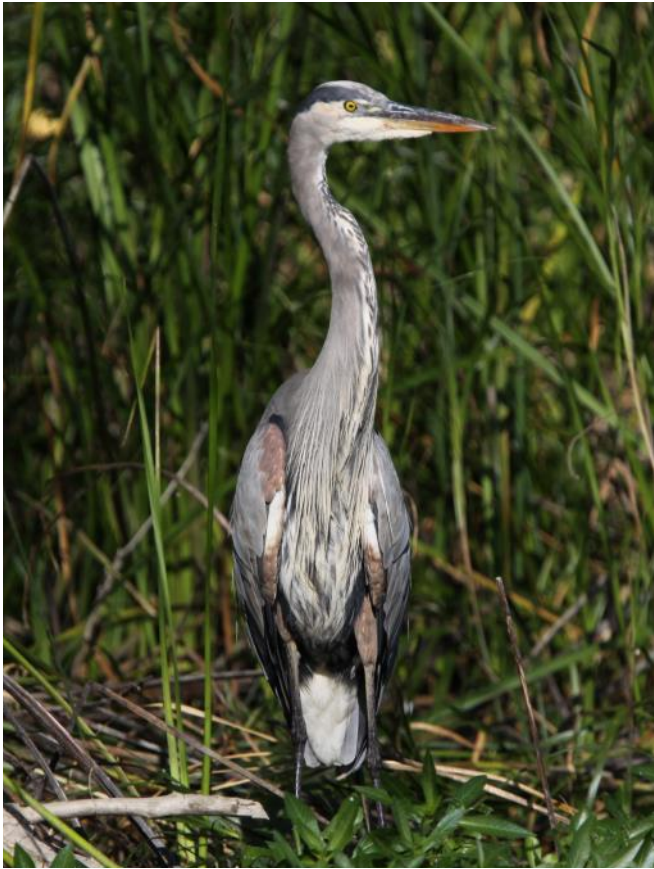
Great Blue Heron.