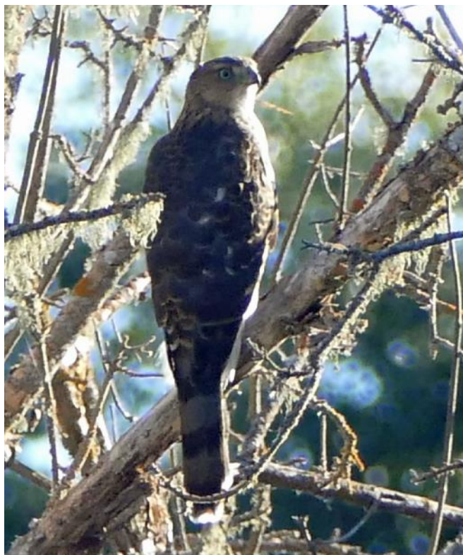
A Sharp-shinned Hawk could be a good sighting.