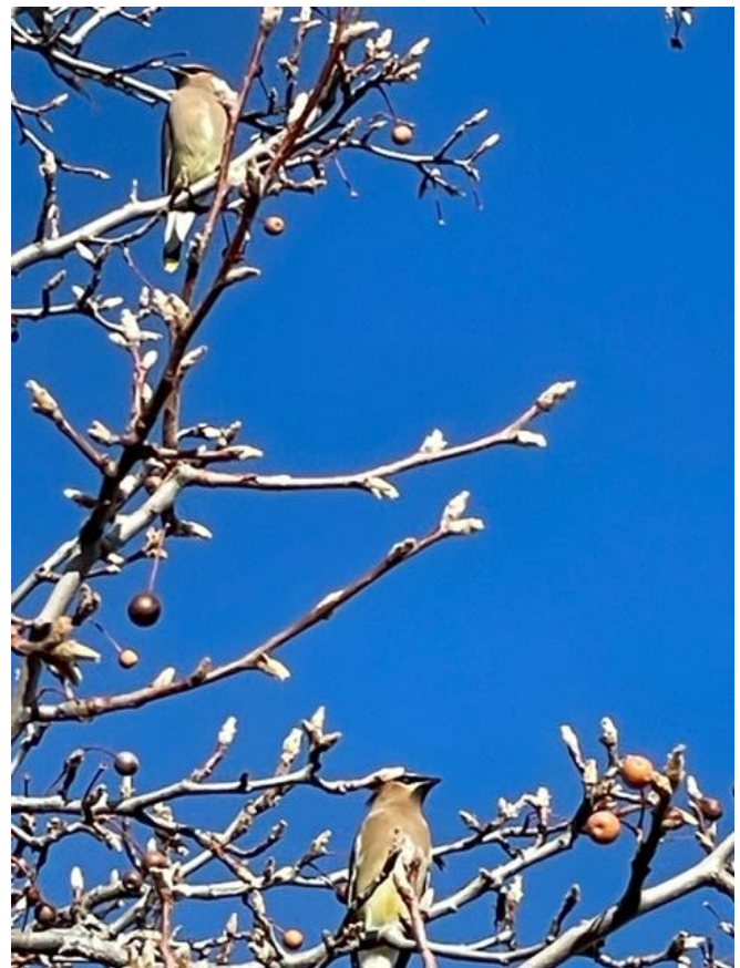
Cedar Waxwings can often be seen.