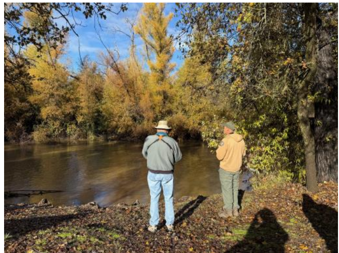
Cole Creek at the park usually yields some good birds.