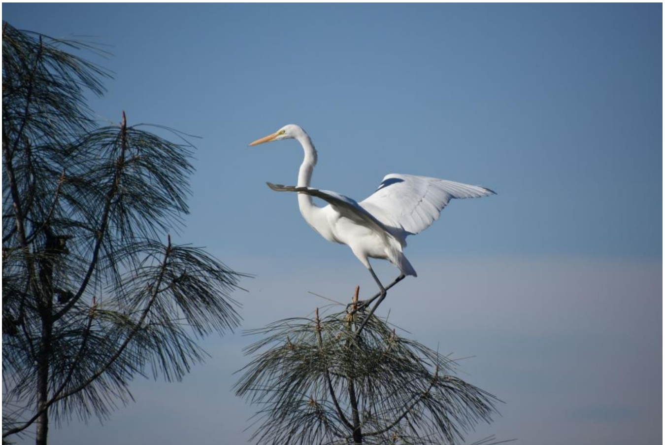
Great Egrets are usually seen on Clear Lake.