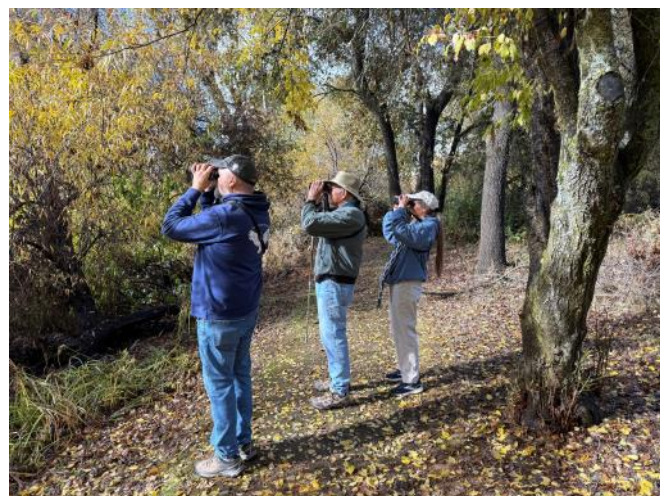
Checking out the Red-breasted Sapsucker at CLSP.