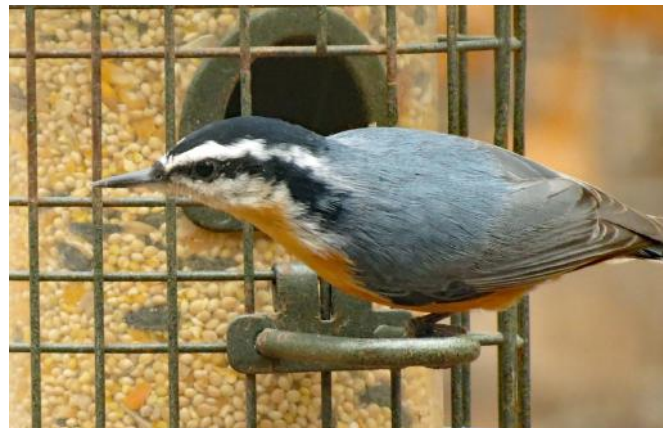
Climate Watch is focusing on certain species including nuthatches.