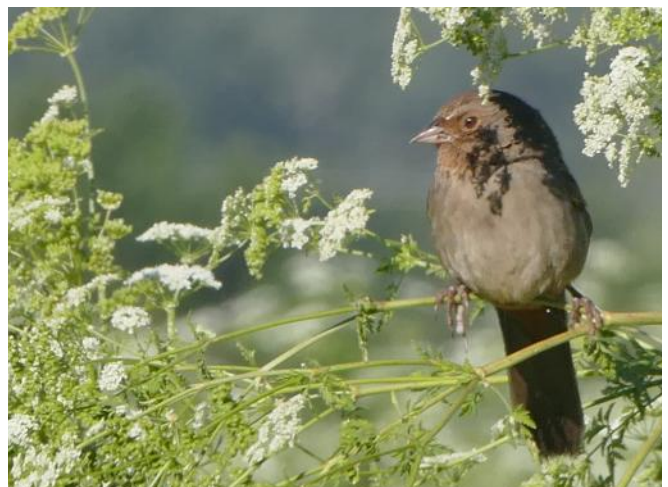
Two species of towhees live in Lake County.