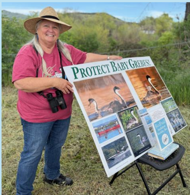
Redbud Audubon has several displays that it shares with many different groups.