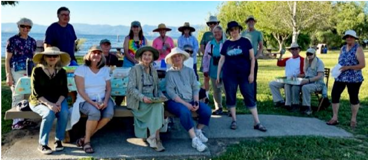
Redbud Audubon members and friends from last year's end-of-year picnic.