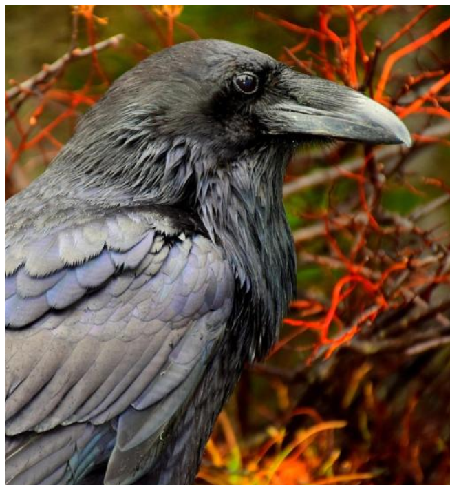
Raven.