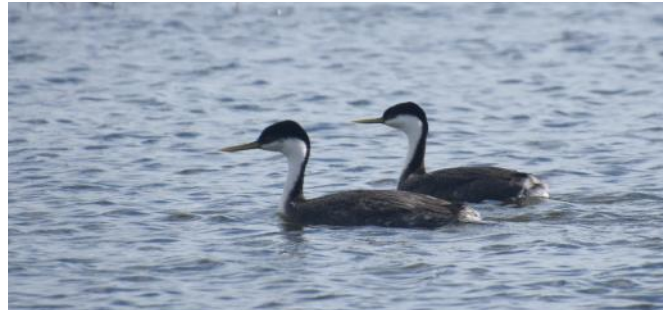
Monitoring of Western and Clark's Grebes will be taking place during nesting season.

Enjoy your May and as always, we are here if you have any questions or observations, you would like us to share. Redbud Audubon's email is: redbud.audubon@gmail.com and our phone number is (707) 805-9410.