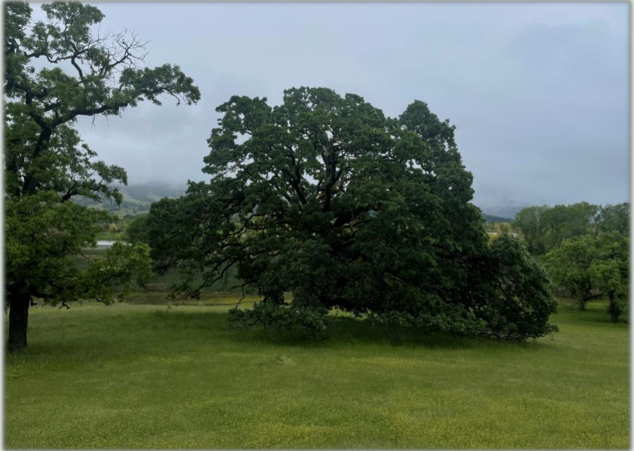
One of the preserve's majestic Valley Oaks.