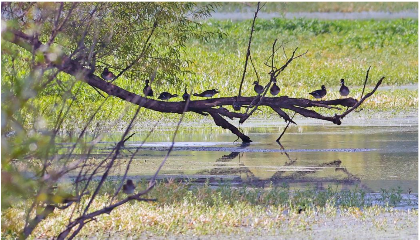
Ed Oswalt got some great images on our Reclamation Area field trip in September, including this beautiful one of Wood Ducks perched in a row on a branch.