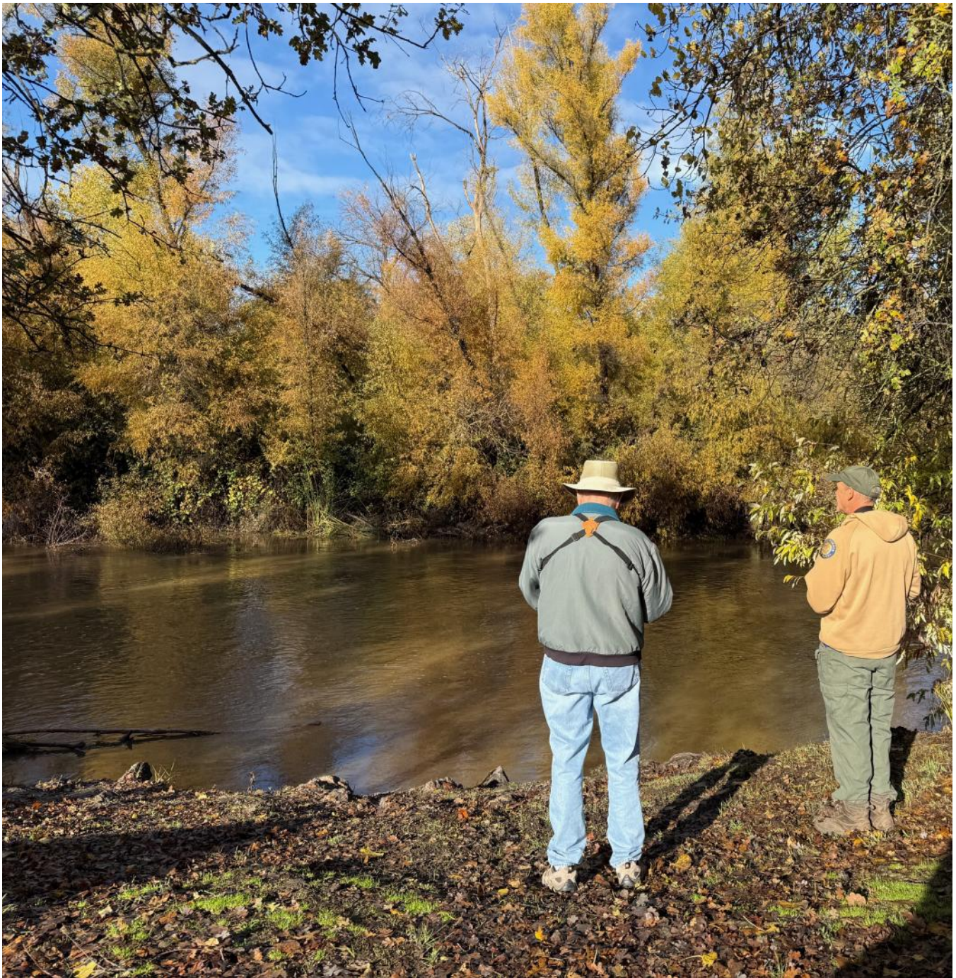
Cole Creek is often a good spot to see wading waterfowl.