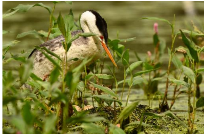
Clark's Grebe on a nest.