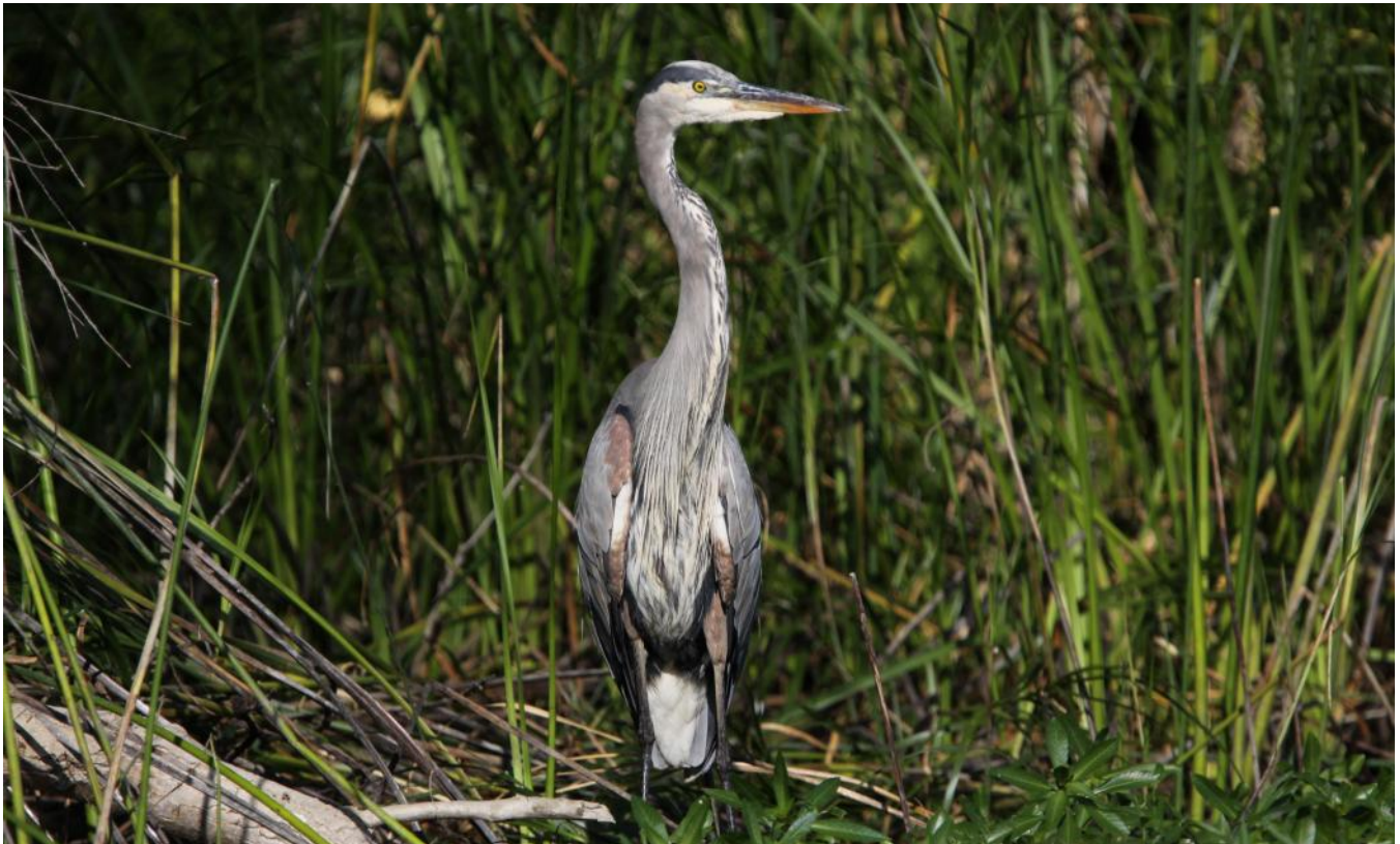
Great Blue Heron at the Reclamation Area.