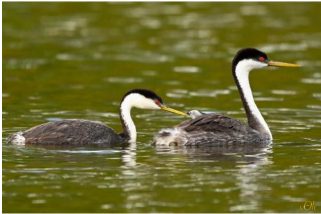
A Western Grebe "couple" at Rodman Slough.