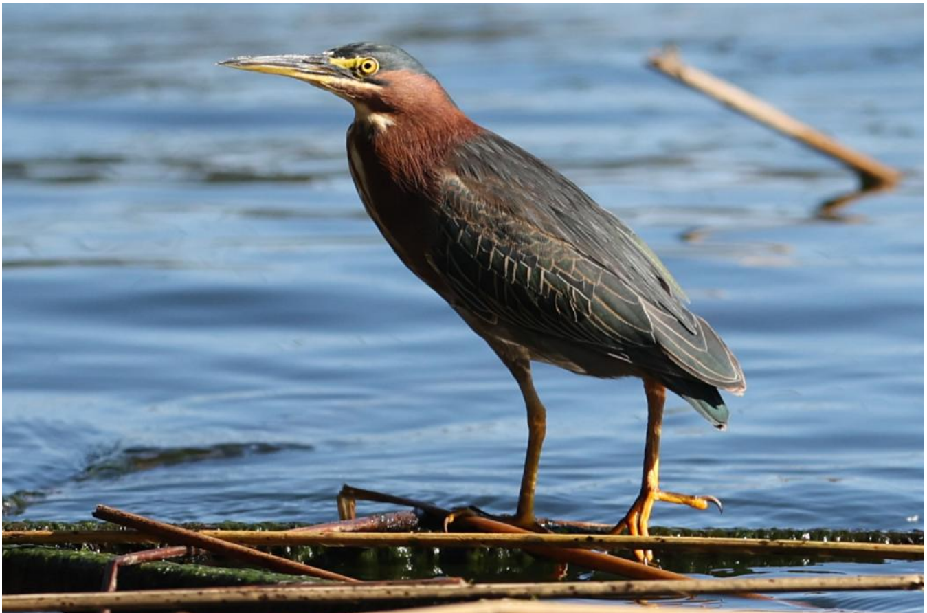
Green Heron.